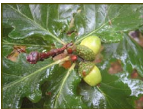
Acorns: ripen to dark brown in October. On Sessile Oak, clustered together without stalk. Rounder than those from Pedunculate Oak.

Oaks woods were often coppiced on a 20 year rotation, which provided a regular crop of smaller timber for firewood and fuel for iron-smelting (at Bonawe and Furnace), also bark for tanning.