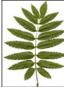
Rowan leaves: compound with 6-8 pairs of stalkless leaflets, 3-6cms long. Leaf stalk 2-4 cms.

Rowan timber could have found many uses, but the taboo against felling the trees prevented its use, except for sacred occasions. Twigs of Rowan were placed above doorways as protection from enchantment.