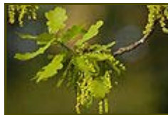
Oak flowers: male & female flowers in separate clusters on the same tree, appear with young leaves in May

Oak is a very long-lived tree, the oldest surviving to 800 or more years, after the first century the oak only grows at about 2.5cms/year, so the wood matures as it grows becoming very hard & close-grained. Oak timber was used for ships and beams for building.