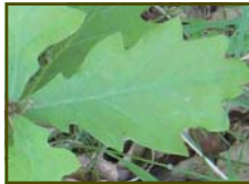
Oak leaves: Alternate, 5-12 cms long, 5 or 6 lobes. Sessile Oak: no ears at base of leaf, leaf stalk 10-25mm

There are two varieties of oak (Gaelic: Darach) native to Britain. Common or Pedunculate Oak ( Quercus robur ) and Sessile or Durmast Oak ( Quercus petraea ). The two forms are similar, but distinct in the way they carry their leaves and acorns. On the Sessile, the acorn cups are on a very short stem, whilst the leaves, which have no ears at the base, grow away from the twigs on a leaf stalk of 10-25mm. The two oaks readily cross, and judging by the characteristics of the trees in the Gearrchoille, I would suggest a number of these are hybrids between the 2 species. New shoots appear on Oaks in July/August – known as Lammass growth – which brings new colour to the trees and means they retain strong leaves well into the autumn. Oaks are the most important trees for supporting wildlife, particularly insects, in Britain – more than 500 species. The bark is also home to numerous lichens and mosses. Acorns have been used as food for pigs, deer, squirrels, mice & in times of hardship, man. Oak –leaf wine can still be bought today. Oak galls (formed by the oak in defense against gall wasp) can be used to make ink; the bark was used with copper mordant to produce a purplish wool dye.